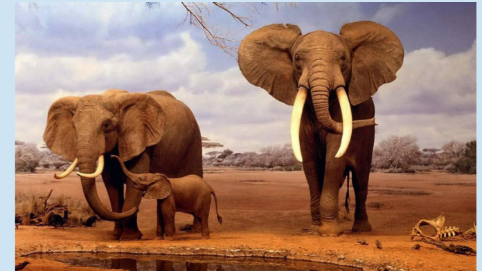
South Africa Trip