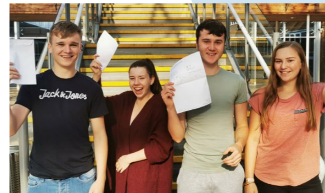
Year 13 Leaver's Meal